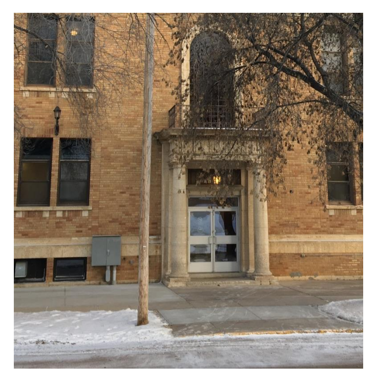
Newly Installed Wood Door