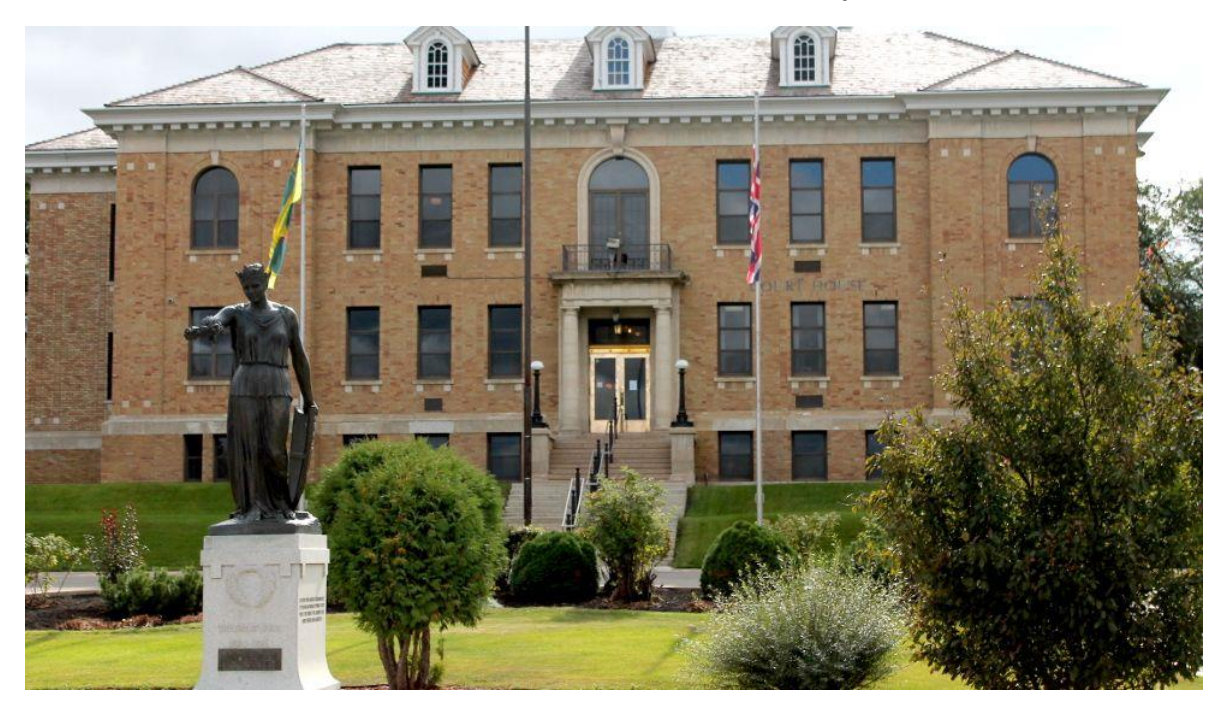
Newly Installed Metal Clad Windows and 2<sup>nd</sup> Floor Balcony Storm Door